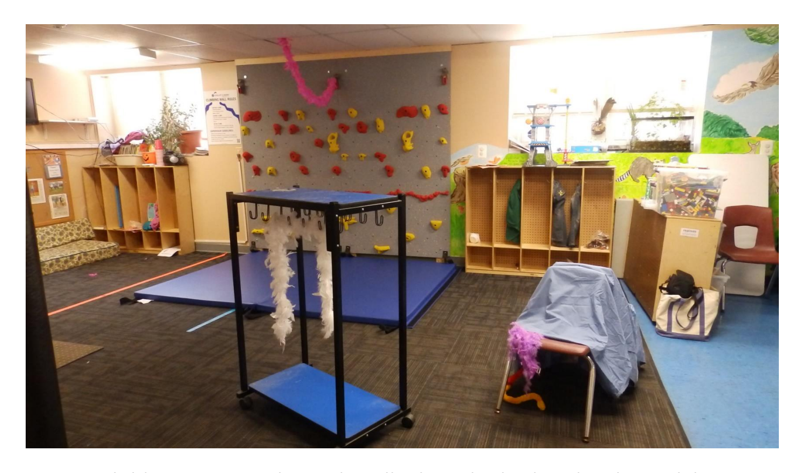
Step 3: Children went to the rock wall. They climbed under the pink boa.

Step 4: Children went "through" the chair tunnel & "through" the cart. Boas were attached to provide sensory stimulation.