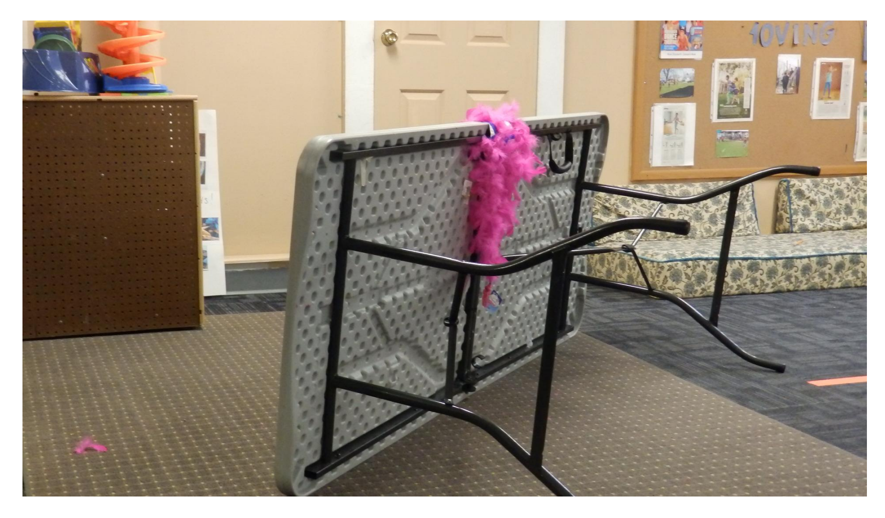
Step 2: Table placed on its side. Pink boa on it for children to go over.