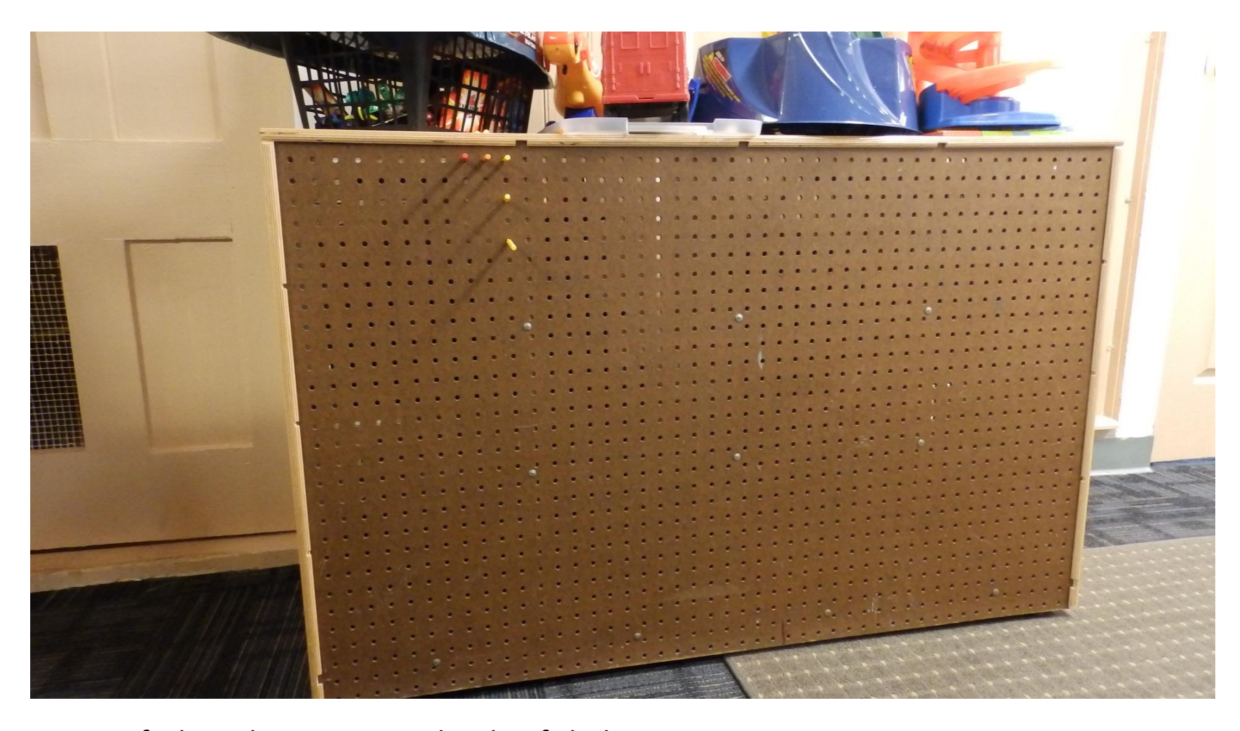
Step 1 of Obstacle Course: Back side of shelving.